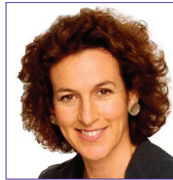
Dawn Primarolo Minister for Children, Young People and Families

A handwritten signature in black ink that reads "Gillian Merron".