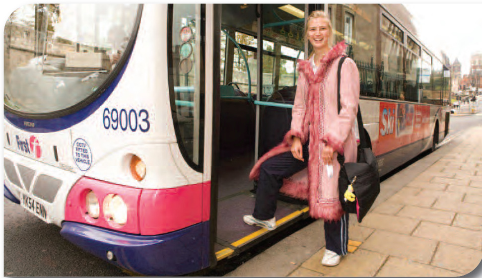
Learning to travel independently