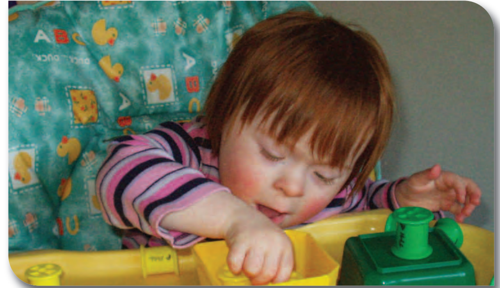
Photographs and comic strips can be used to share what children like to do with others

UN Rights of the Child Article 12 www.unicef.org.uk